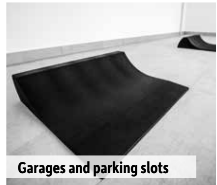
Garages and parking slots

The surface and ambient temperature must be at least 5 ° C. The Elements should only be glued in dry weather. Adhesive cartridges must not be stored below 10 ° C.